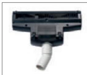
Turbo Brush: Bottom view

Ideal for cleaning of carpets and rugs. It's square edges allow access to the most difficult areas to clean. The roller brush speeds up with airflow and dislodges dirt or dust. A must have for carpet floors.