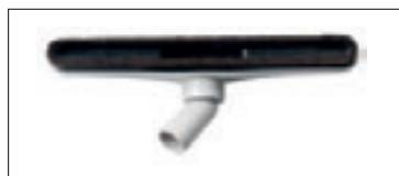
Hard Floor Brush: Bottom view

This has soft bristles which prevents damage to floors and cleans thoroughly. A must have for any home that has large areas of wooden or tiled floors. Available in 10 or 14 inch sizes.